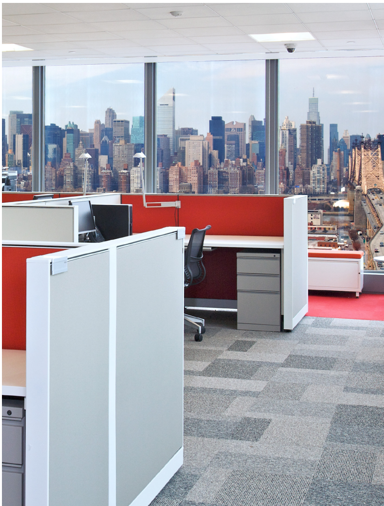
New York City Department of Health and Mental Hygiene Headquarters Long Island City, NY