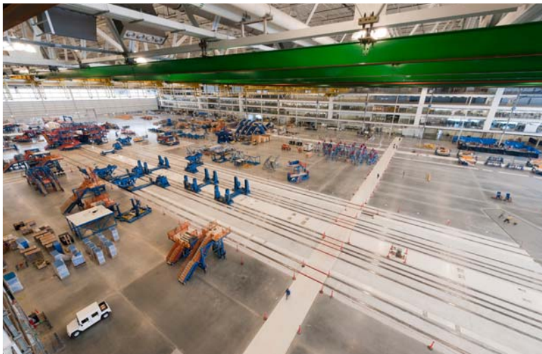
Boeing South Carolina 787 Final Assembly and Delivery Building North Charleston, South Carolina